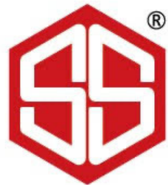
SUPER SMELTERS LTD.