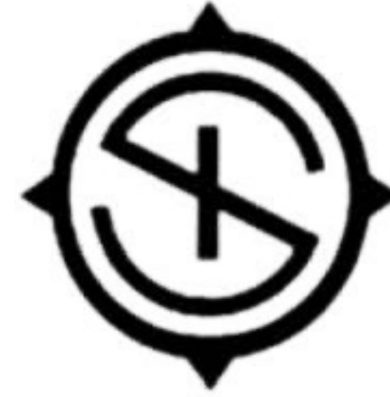
Orissa Sponge Iron and Steel Ltd